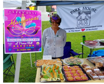
Our booth of goodies at Harvest Fair