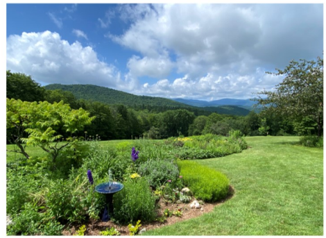
The Garden Tour was a great way to spend a beautiful Summer Saturday!