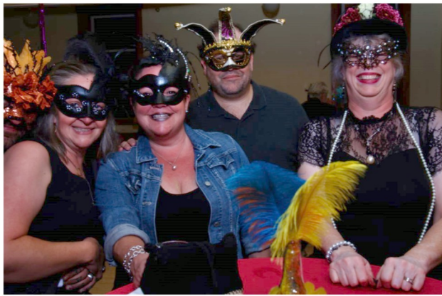
The Masquerade was a mysteriously fun event!