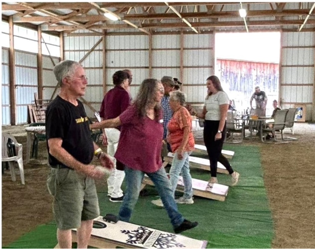
A brand new event this year: Park House Corn Hole Tournament!